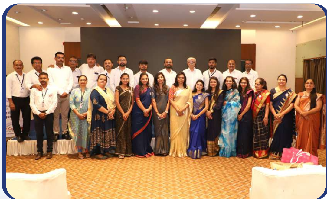
Team – Life Blood Centre