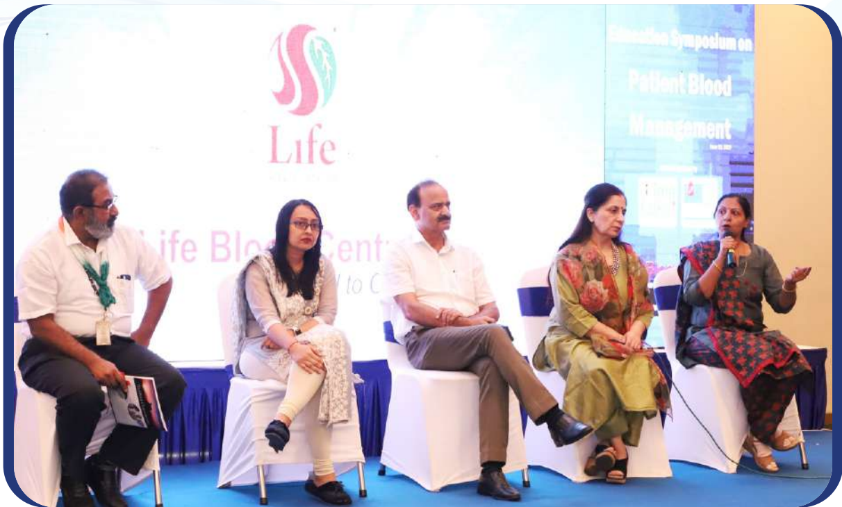
Distinguished Panel Members

There was an elaborate and engaging Question & Answer session which incorporated common issues faced by clinicians related to transfusion practices and queries related to safe transfusion were addressed by the esteemed speakers.