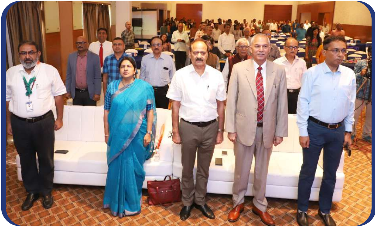
Distinguished guest standing for the national anthem