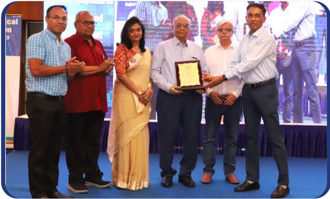
Felicitation of Life Blood Centre by IMA Rajkot