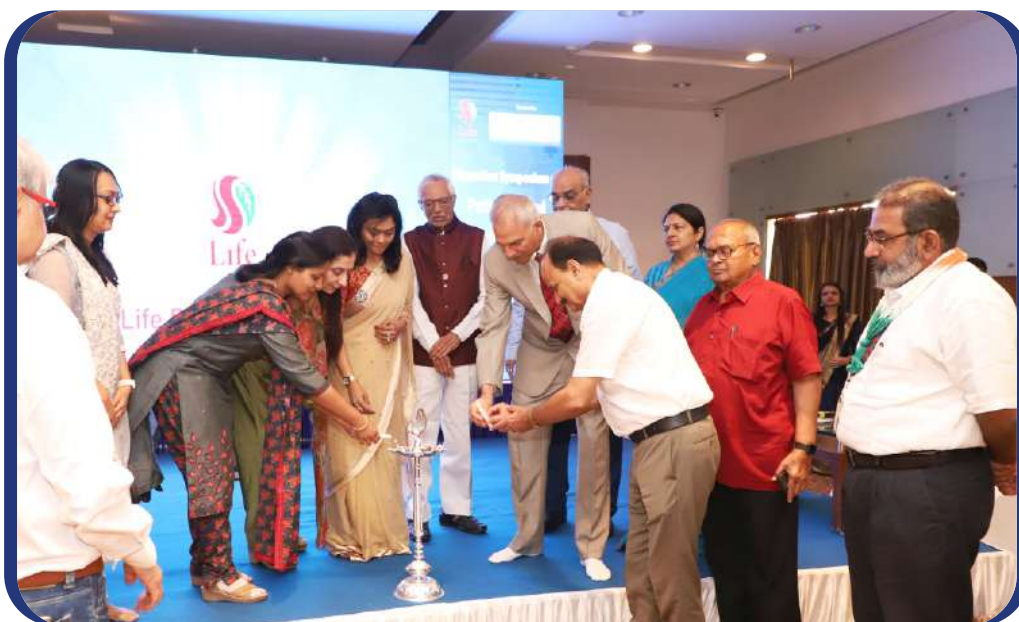
Lighting of Lamp